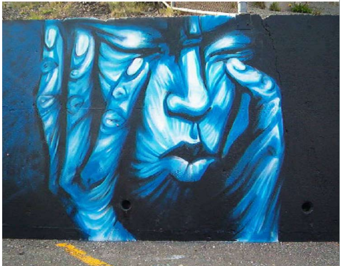
Mural by youth in downtown St. John’s