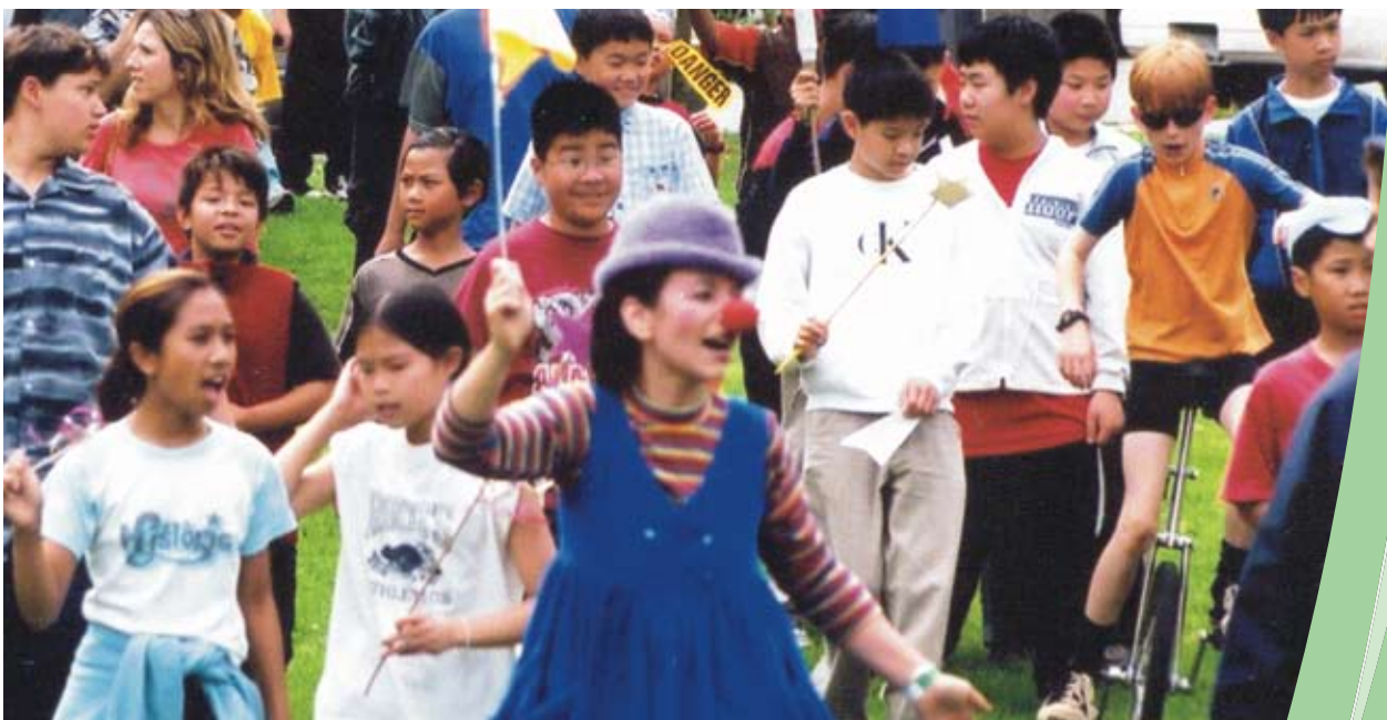
Circus of Dreams, 2001 (Vancouver) Public Dreams Society

Cultural planning is a way of looking at all aspects of a community's cultural life as community assets. Cultural planning considers the increased and diversified benefits these assets could bring to the community in the future, if planned for strategically. Understanding culture and cultural activity as resources for human and community development, rather than merely as cultural "products" to be subsidized because they are good for us, unlocks possibilities of inestimable value. And when our understanding of culture is inclusive and broader than the traditionally Eurocentric vision of "high culture," then we have increased the assets with which we can address civic goals.